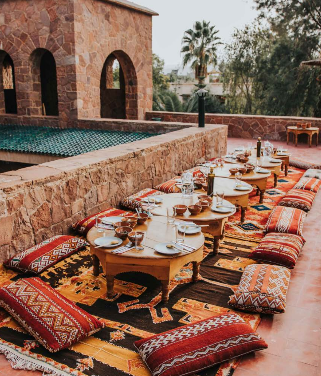
Traditional Moroccan and Berber meals are cooked daily with fresh and local produce.