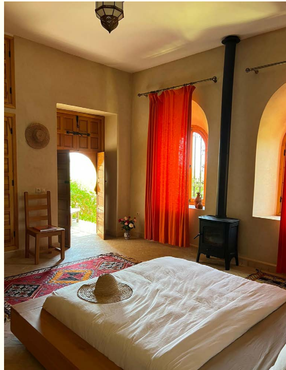
Guest rooms are spacious and authentic: carpets, cushions, crafts, and a traditional Berber bed futon.