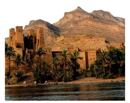
Route: 65 km, 1 hour and 30 min drive and 20 min of sand road in the desert

If you are an early riser, enjoy the sunrise from the terrace of your room. After a good breakfast, we visit the antique village of Aït Ben Haddou (continually restored) and possibly the tomb of the patron saint of the region, Sidi Ali Ben Ouamer, as well as the Jewish cemetery located east of the Kasbah. We continue the journey via Ouarzazate and visit the Oscar studios where the sets of many films are still on site, such as: Asterix, Obelix and Cleopatra, Gladiator, Babel, Prince of Persia, etc. After lunch, we head to Fint's oasis for a nomad style tea, a camel ride (a single hump dromedary) and a short walk along the mountains overlooking the oasis. We then join the Dar Daif Kasbah for dinner and stay; a beautiful swimming pool is available.