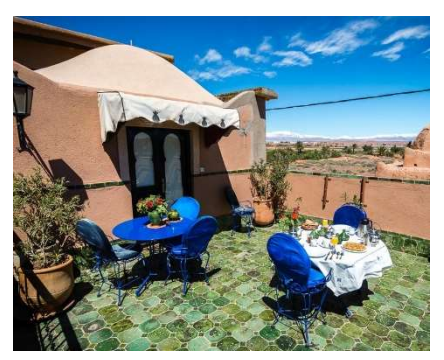
Route: 265 km, 5 hours and 15 min drive

After a breakfast at the Kasbah's terrace, we drive Southwest. We stop at Taznakht's Sunday souk, the capital of Berber carpets on the South face of the Atlas. We continue our journey heading North toward Tisselday's valley and have lunch at the Tizi N Tichka before returning to Bab Zouina.