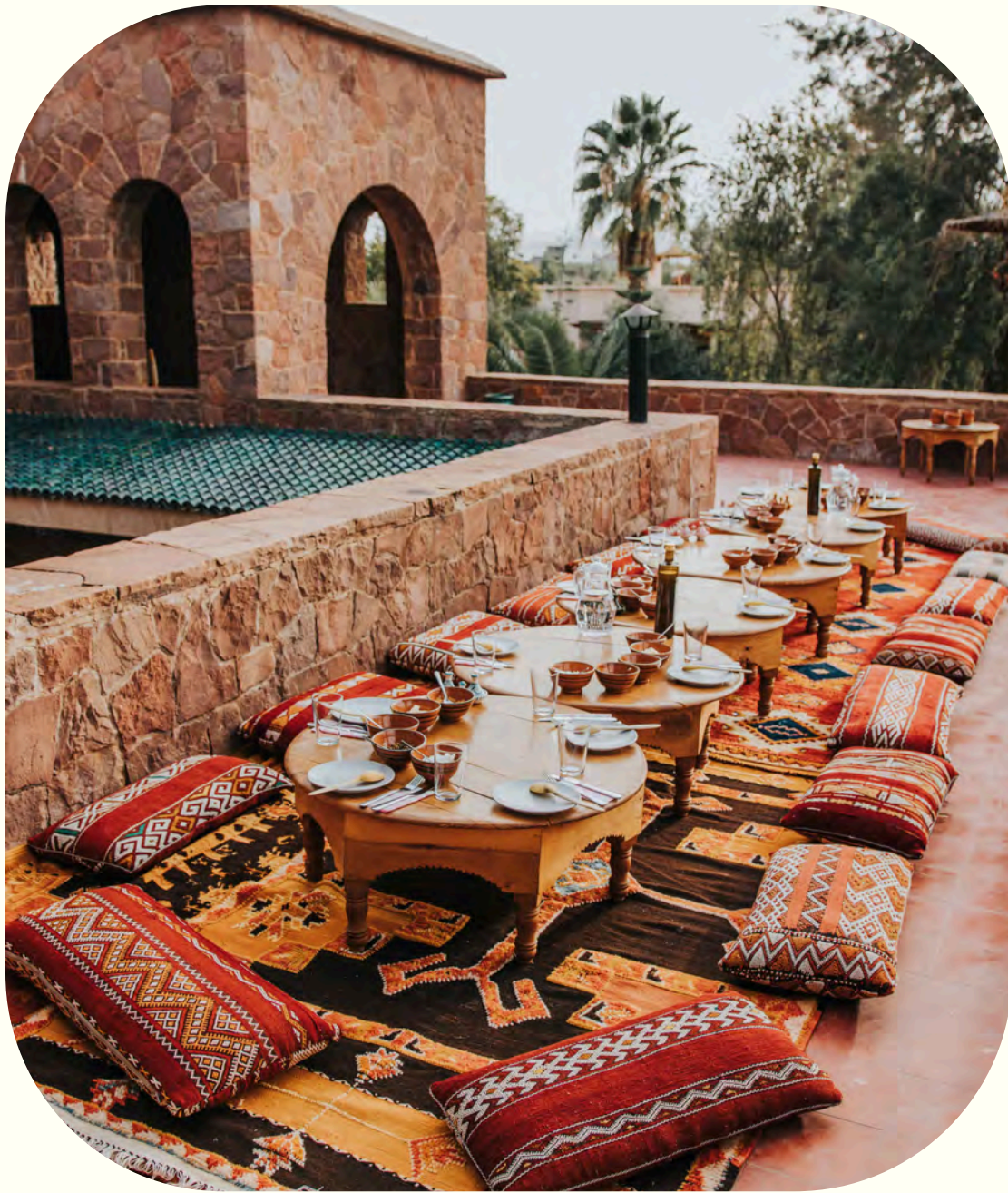
Authentic open air spaces to enjoy our snacks and Ayurvedic meals.

Bab Zouina has several ecological buildings spread across its wide domain. Our buildings are inspired by beautiful traditional earth architecture. Our spacious domain has various terraces and peaceful places that allow guests to relax.