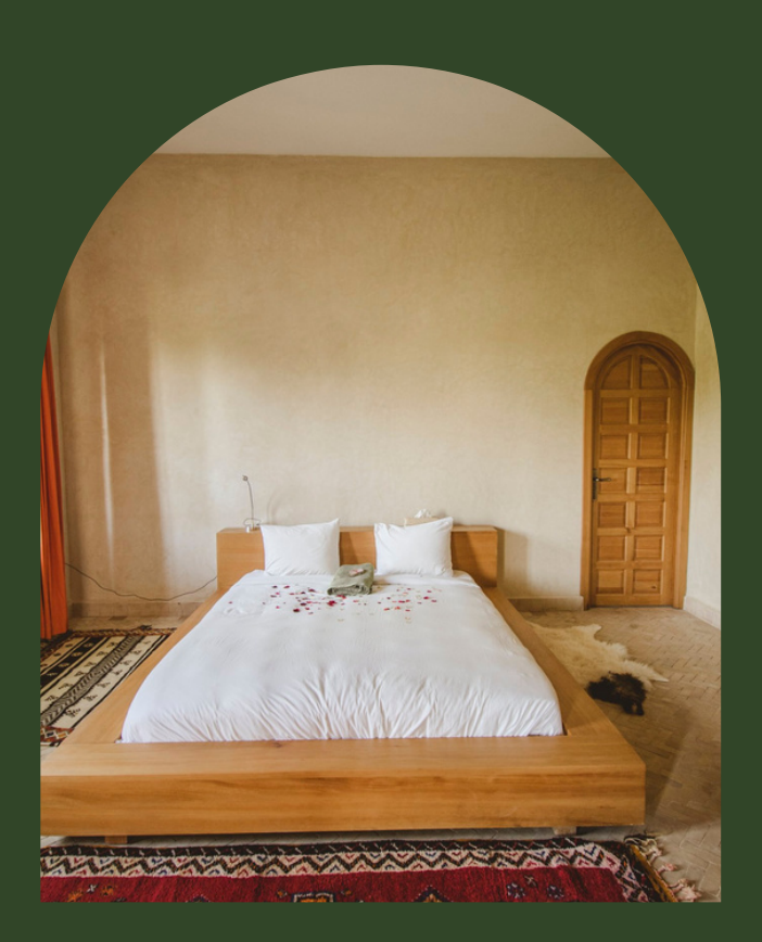
Deluxe Double Shared 790€ (deposit of 300€)

1 Guest only - King size bed, private balcony and private Bathroom.