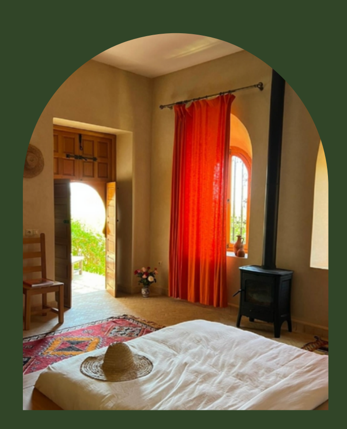
Deluxe Single Suite 890€ (deposit of 300€)

1 Guest only - King size bed, private balcony and private Bathroom.