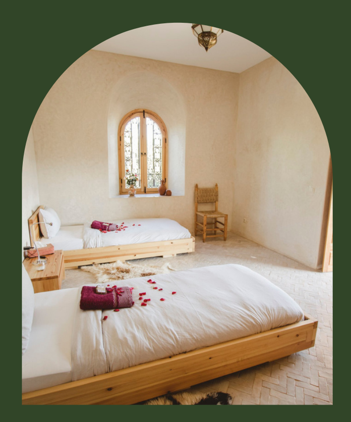
Deluxe Double Room 730€ (deposit of 300€)

Price per person, Room is for 2 guests, possibility for separate beds with a private balcony, and Bathroom