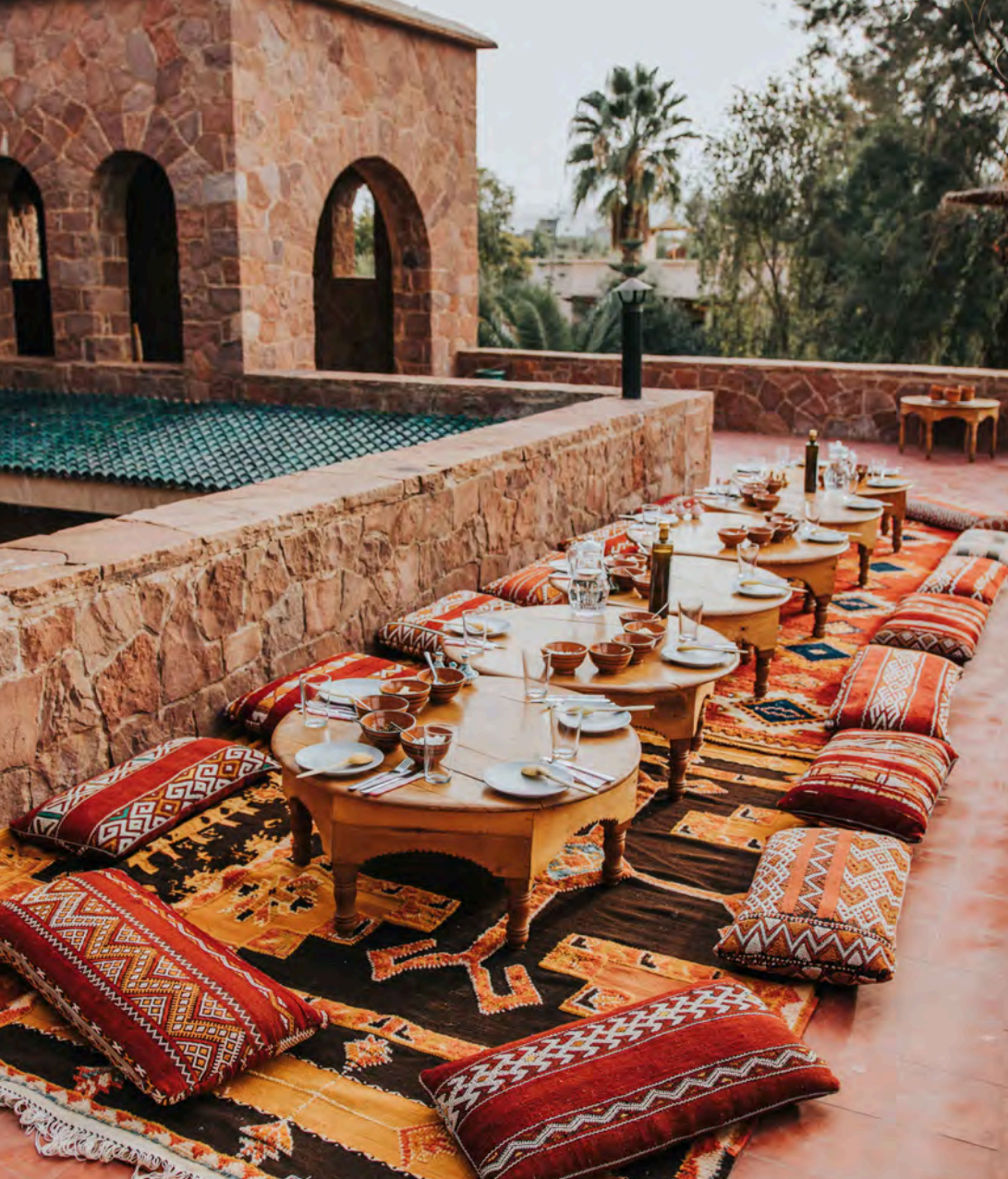
Traditional Moroccan and Berber meals are cooked daily with fresh and local produce.

Guest rooms are spacious and authentic: carpets, cushions, crafts, and a comfy bed.